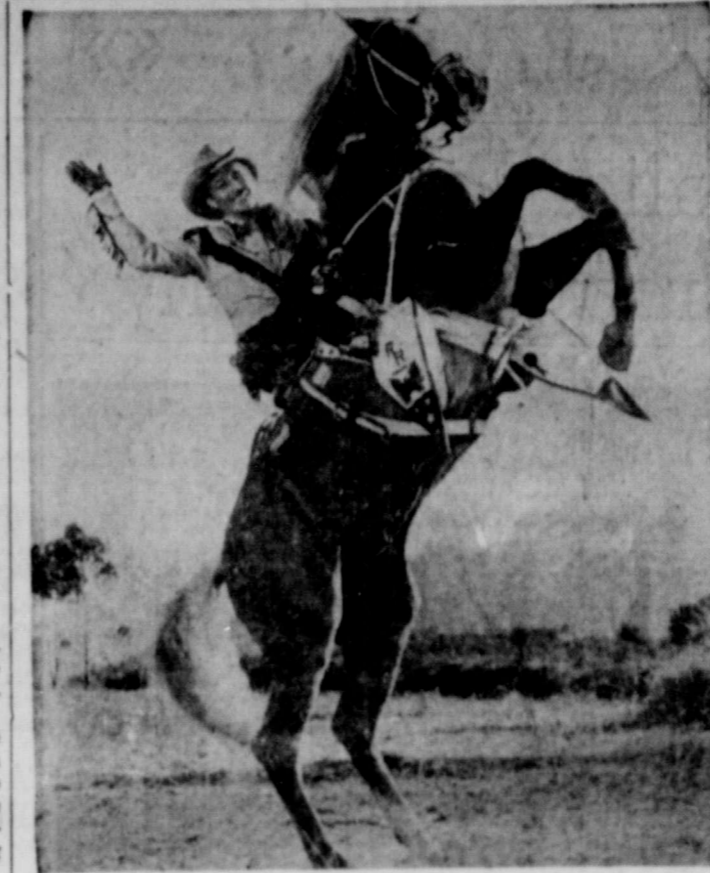
ROY ROGERS, "King of the Cowboys," and his educated horse "Trigger" are part of what to expect at 18 performances of the World's Championship Rodeo at the Houston Fat Stock Show and Livestock Exposition, Feb. 1 through 12, in Houston. This will be the Western motion picture and radio star's only personal appearance in 1950.

GENERAL ELECTRIC DISHWASHER WEEMS Refrigerator Service All Types Electrical Work 108 South Rusk Phone 320