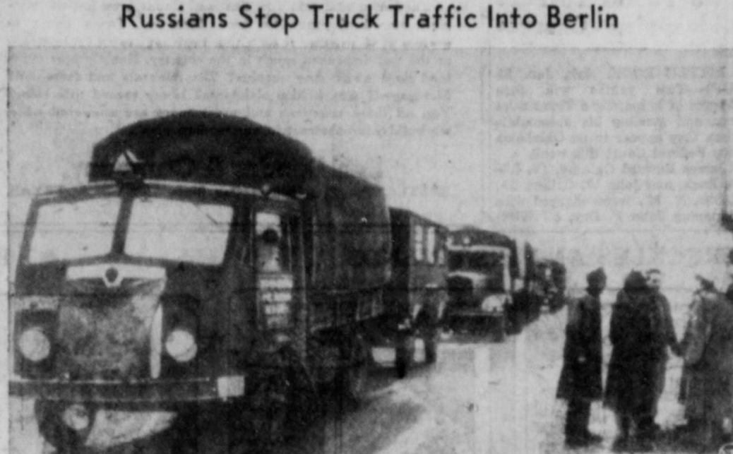
Russians Stop Truck Traffic Into Berlin

For Good Used Cars (Trade-in on the new Olds) DeSoto Motor Company, Eastland