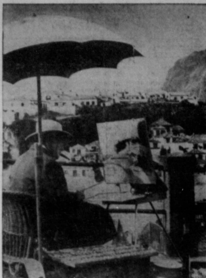
WINNIE IS UNDISTURBED —Announcement in London that a general election that Conservatives hope will make Winston Churchill prime minister again would be held February 23 failed to disrupt the vacation of the doughty opposition leader. The Labor government's No. 1 foe and Mrs. Churchill are vacationing in Madeira, where Churchill is seen engaged in his favorite diversion, painting a scene in the village of Camara de Lobos, near Funchal.