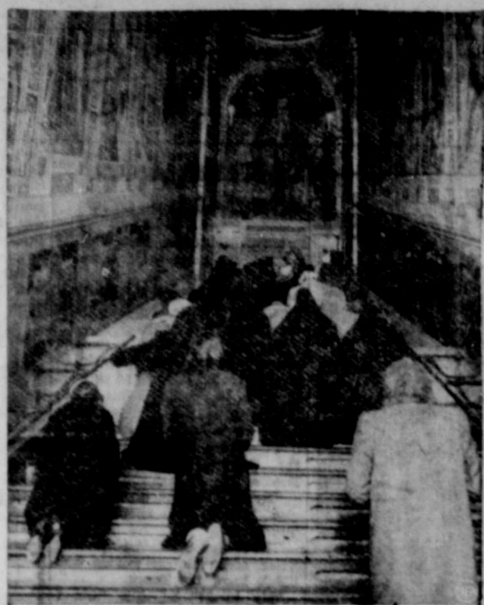
PRAYERS AT HOLY STAIRS—Visitors to Rome for the Holy Year kneel in prayer on the Holy Stairs, one of the city's most sacred monuments. The "Scala Santa," facing the Basilica of St. John in Lateran, is a flight of 28 marble steps from the palace of Pilate. Legend says these are the same steps up which Jesus walked to his trial.