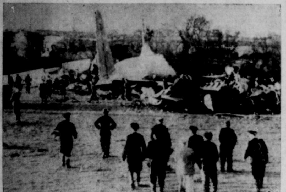
General view of the wreckage of the giant Tudor II, a British transport plane, which crashed at Llandow, Wales. Eighty persons died in the crash and two of the three survivors are in critical conditions.