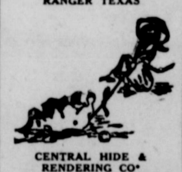
CENTRAL HIDE & RENDERING CO.

Your Local USED-COW Dealer Removes Dead Stock FREE For Immediate Service PHONE 83 COLLECT RANGER TEXAS