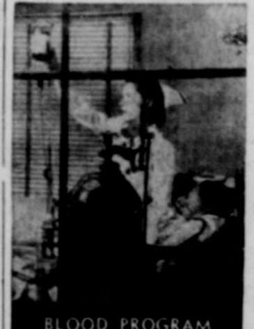
BLOOD PROGRAM The Red Cross National Blood Program, with about 500 chapters participating, supplies blood to 3000 hospitals and clinics. —GIVE TO THE RED CROSS—