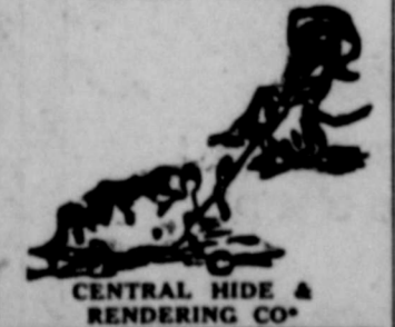
CENTRAL HIDE & RENDERING CO.

Your Local USED-COW Dealer Removes Dead Stock FREE For Immediate Service PHONE 53 COLLECT RANGER TEXAS