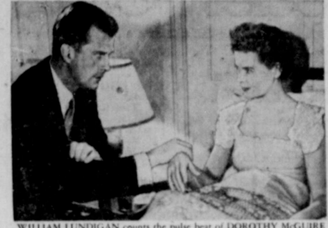
WILLIAM LUNDIGAN counts the pulse beat of DOROTHY MCGUIRE in this scene from 20th Century-Fox's "MOTHER DIDN'T TELL ME."