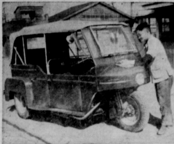
JAP AUTO FEATURES "THREE-WHEELING"—Making its first appearance in Tokyo is this "Giant" auto, built on a motorcycle chassis, but capable of carrying five passengers. The "convertible sedan" sells for the U. S. equivalent of $780.

Don't hesitate to explain to your sporting goods store that you are a beginner and that you want their help in selecting a light, light action rod, in the price class which your pocket-book will permit. Try the rod for personal fit, balance and natural