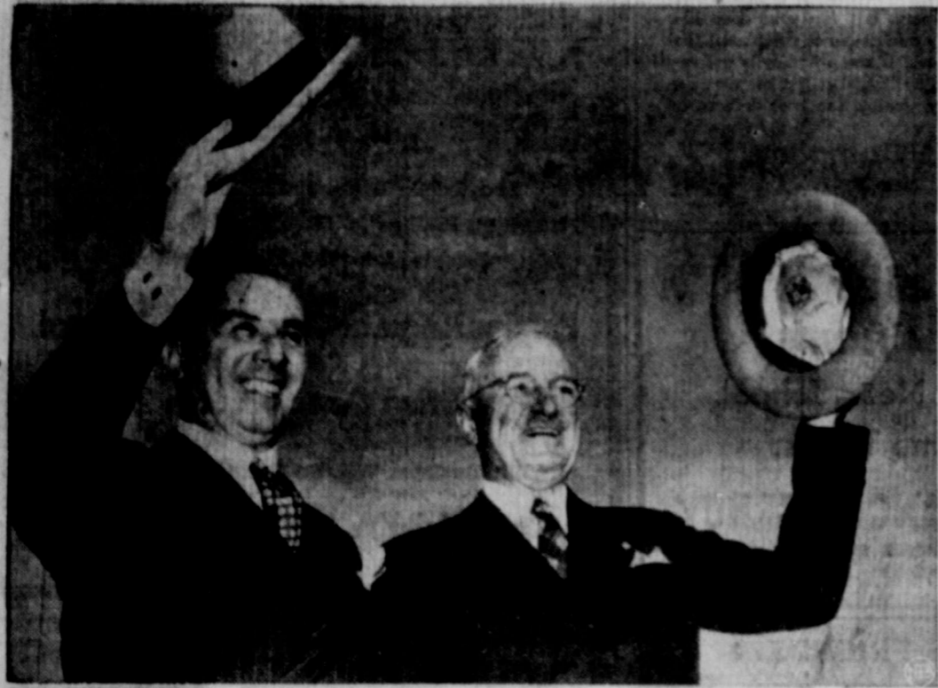
Chilean President Gabriel Gonzalez-Videla, left, and President Truman wave to a welcoming crowd during ceremonies as the Chilean President arrived in Washington for an official visit.