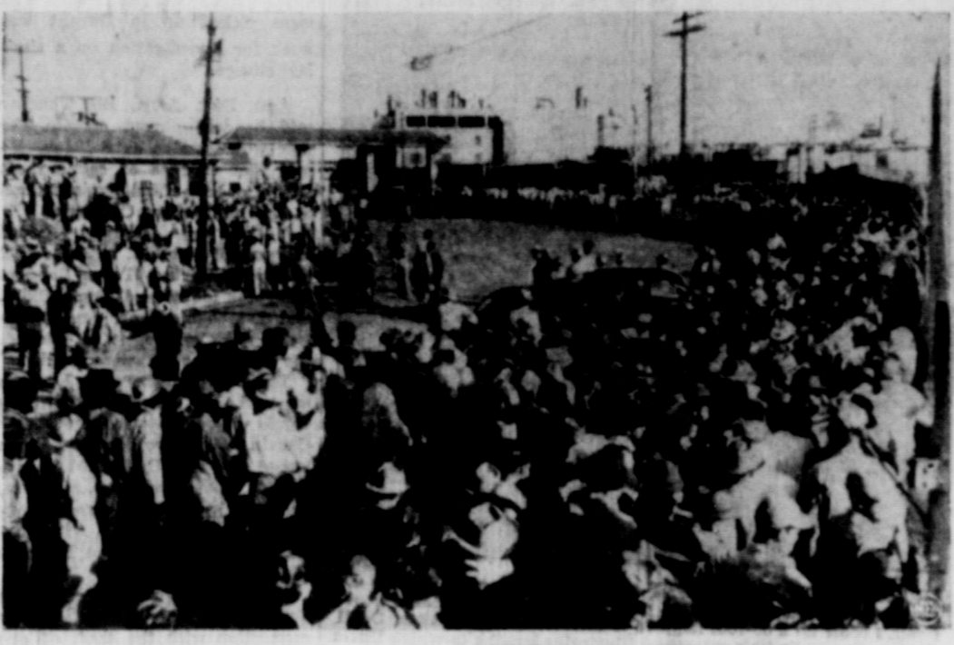
Four Thousand Strong

On orders of Oil Workers International 4,000 Texas Company employees line up at the Port Arthur, Texas, plant to go back to work. The company however, in a formal statement, said the "strike still on." In taking this position company officials pointed out that the union had walked out on their plant at Casper, Wyoming, just five days after operations were resumed. Cost of shutting down and reopening a plant without assurance that operations will be resumed for a reasonable length of time made the company unwilling to reopen the Port Arthur and Port Neches plants.