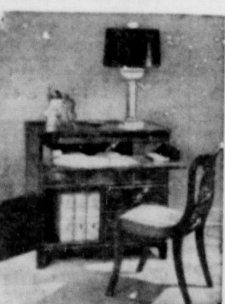
This 18th Century desk chest combines luxury and function. The front drops down to form a desk, the sliding shelf pulls out to make a server, and the two cupboards can hold record albums, files, shoes, etc. (Kindel Furniture Co.)

DO YOU HATE CHANGE OF LIFE? and HOT FLUSHES?