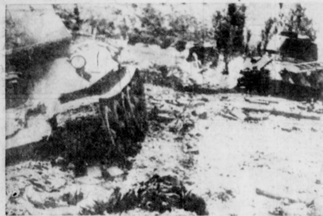
BATTLE FIELD AFTERMATH —The body of a North Korean soldier lies in front of his tank which was knocked out in the fighting near Indong. This photo was made by a South Korean Signal Corpsman.