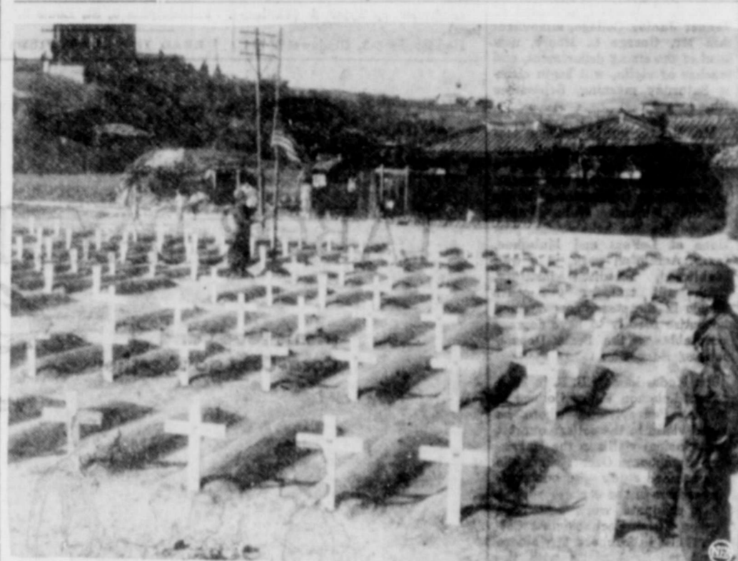
CROSSES ERECTED OVER FALLEN U. S. SOLDIERS—While one American soldier stands at attention, another lowers the flag over the 1st Cavalry Division cemetery in Taegu, South Korea. Not all of the crosses have been erected over the fallen soldiers graves.