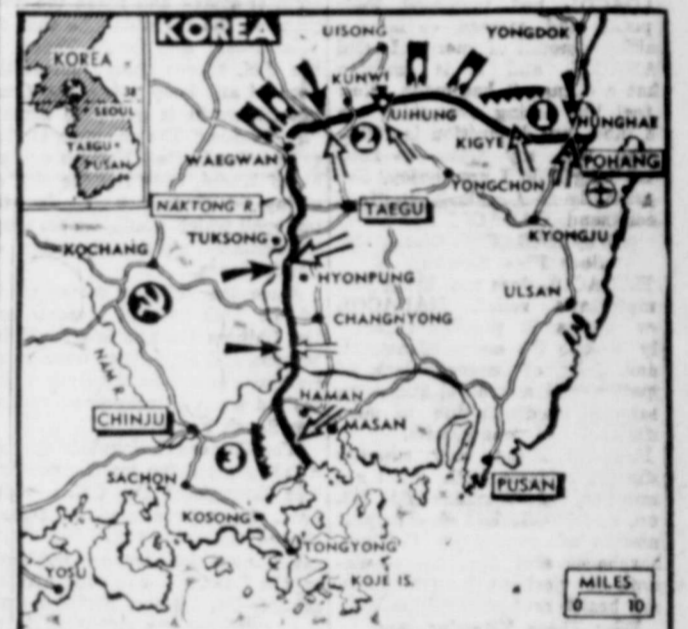
FIGHT FOR POHANG—Allied forces on the east coast of Korea (1), fought to save Pohang as South Koreans recaptured Kigye. On the northern flank Reds pushed four miles south of Uihung (2) as enemy massed men and armor (tank symbols) in that area. United Nations troops in the south repulsed Communist patrol action west of Masan (3). Reds were building up defenses (sawtooth lines) in the south and east against expected United Nations counter-attacks. (NEA Telephoto).

Coach Warden today is leaning towards a repeat of last year's team that depended more on speed and agility than heft.