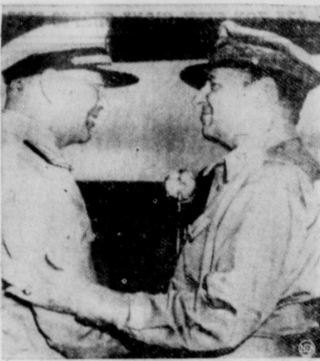
ADMIRAL RADFORD VISITS MacARTHUR —Admiral Arthur W. Radford, left, commander-in-Chief of U. S. Pacific Fleet, is greeted in Tokyo by General Douglas MacArthur.

READ THE CLASSIFIEDS Do you suffer distress from Periodic FEMALE WEAKNESS which makes you NERVOUS several days before? Defemefunctional monthly ailments make you suffer pain, feel so strangely restless, weak—at such times, or just before your period? Then start taking Lydia E. Pinkham's Vegetable Compound about ten days before to relieve such symptoms. Pinkham's Compound works through the sympathetic nervous system. Regular use of Lydia E. Pinkham's Compound helps build up resistance against this annoying distress. Truly the woman's friend! Note: Or you may prefer Lydia E. Pinkham's TABLETS with added iron. LYDIA E. PINKHAM'S VEGETABLE COMPOUND