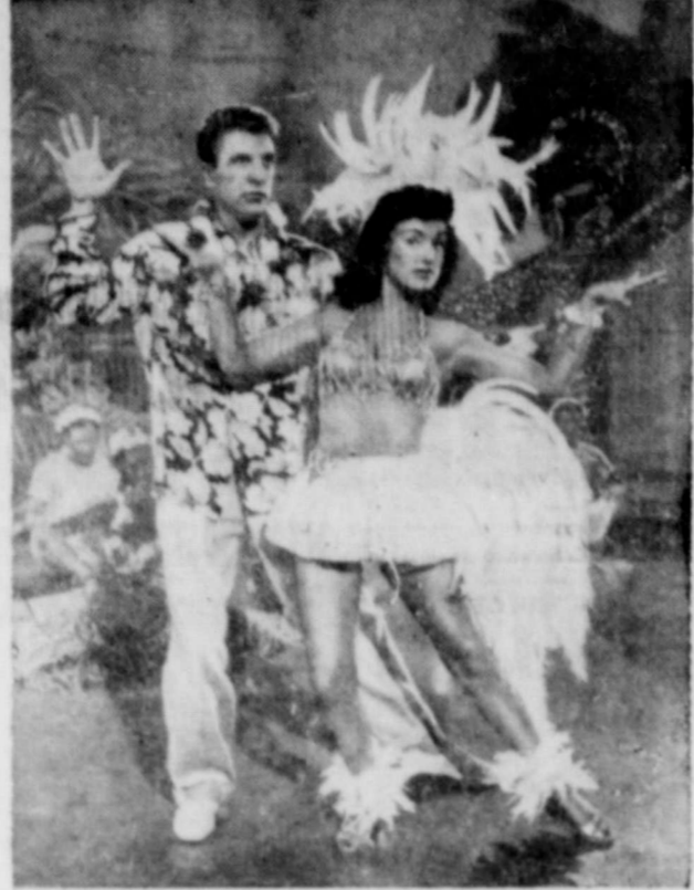
"The Friendly Islands" are populated by Betty Grable and Dan Dailey in one of the many scintillating musical numbers in the Twentieth Century-Fox Technicolor production, "My Blue Heaven," which arrives today at the Arcadia theatre.

WANTED: Clean Cotton rags Ranger Times, Phone 224