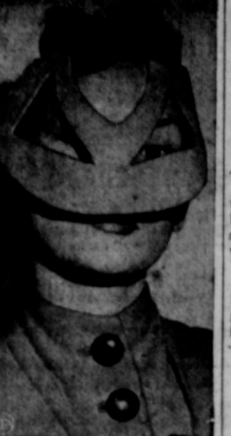
PEEK OF FASHION —Parisian designer Schiaparelli includes this mischievous mask hat in her mid-season collection. The teasing topper is made of beige suede.