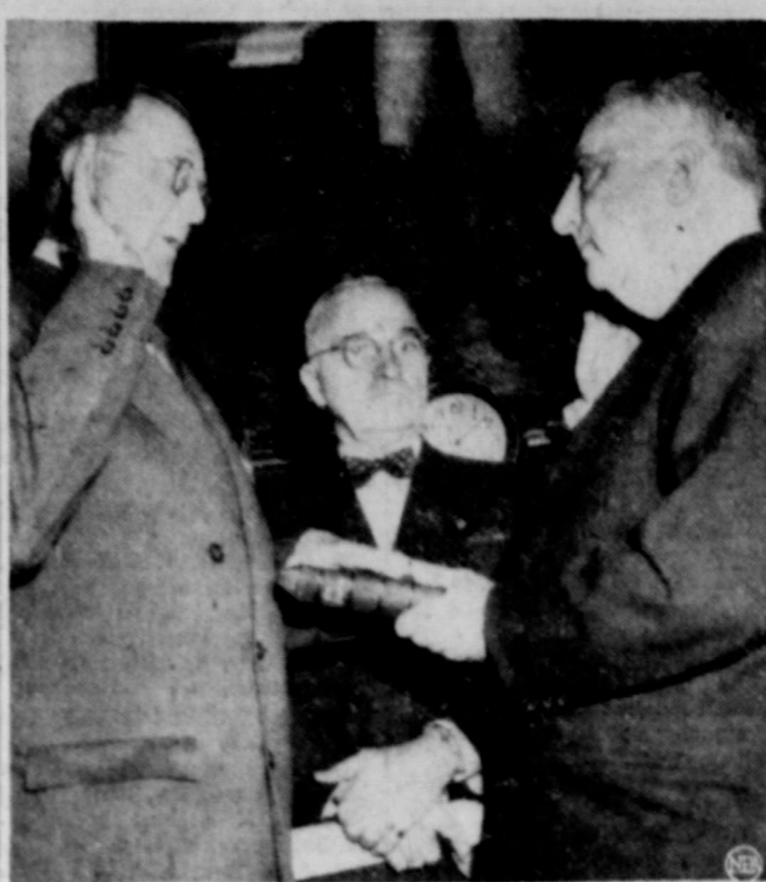
WILSON SWORN IN AS MOBILIZATION DIRECTOR A grim-faced Harry Truman, center, watched as Charles E. Wilson, left, took the oath as Chief of vast defense mobilization program. Chief Justice of the United States Supreme Court, Fred M. Vinson, right, administered the oath.