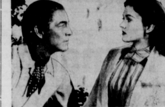
ROBERT TAYLOR tells PAULA RAYMOND the Indians will fight for their lands, in this scene from MGM's "DEVIL'S DOORWAY."