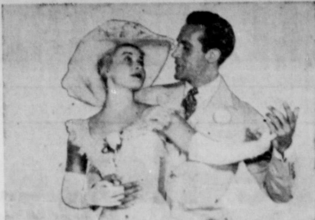
JANE POWELL and RICARDO MONTALBAN do a dance routine in a scene from MGM's "TWO WEEKS WITH LOVE," in Technicolor.