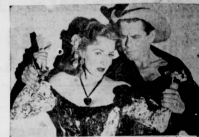
GLENN FORD subdues the excitable RHONDA FLEMING in this scene from Paramount's "REDHEAD AND THE COWBOY."