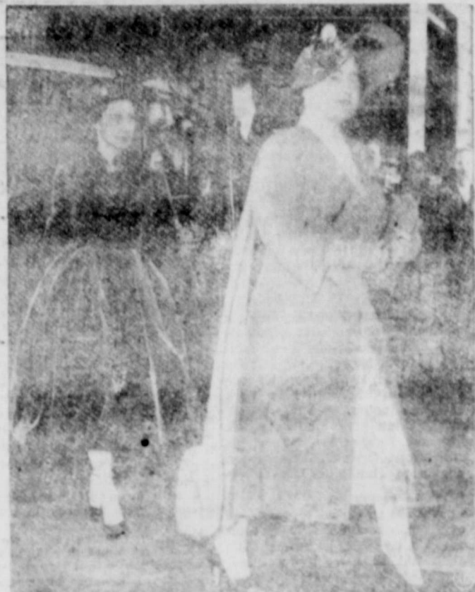
DRESSED IN ROYAL STYLE —Wearing striking spring ensembles, Queen Elizabeth of Great Britain, followed by Princess Margaret, arrives at the London home of Lord Pothoreme to see a private fashion show. It displayed 60 dresses from the spring collections of Britain's "top tier" fashion designers.

VOTE FOR FRANK PENN For Street Commissioner