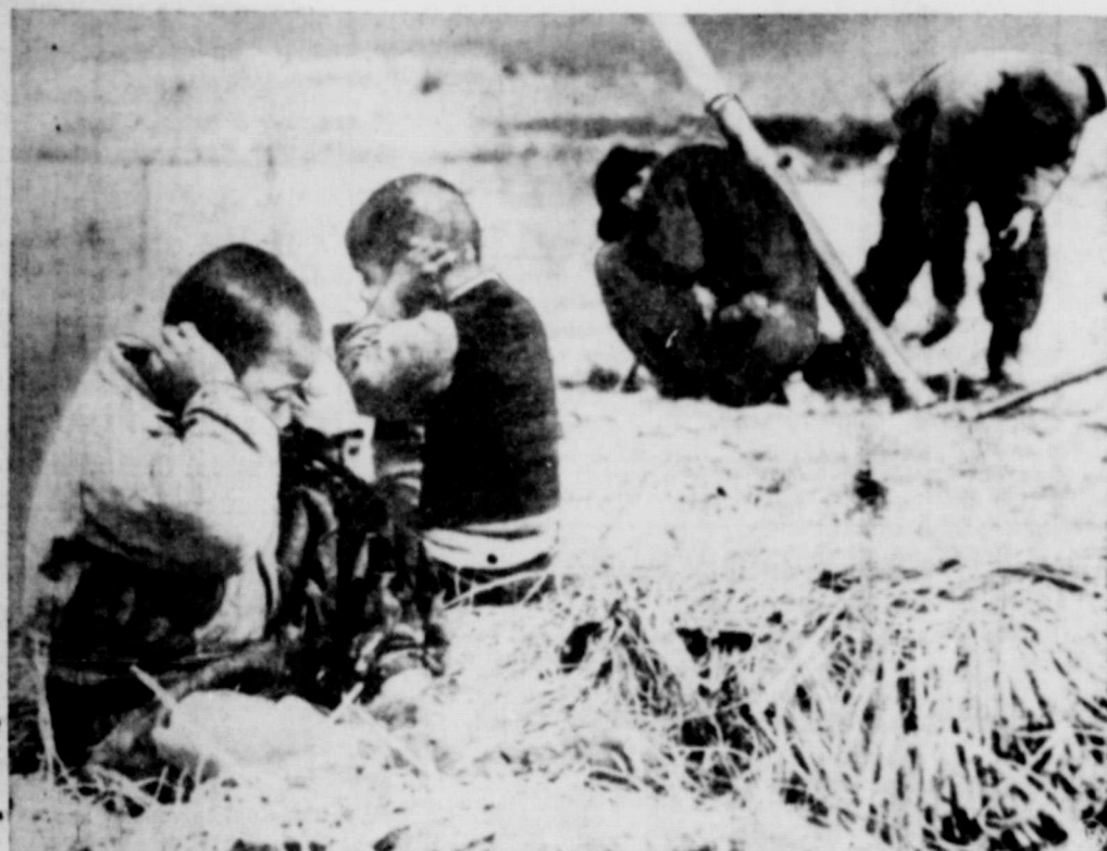
OLD TIMERS AT THIS GAME —Acting like combat veterans, these Korean children cover their ears and duck as a heavy mortar is fired by U. S. soldiers at the Red enemy in Korea.