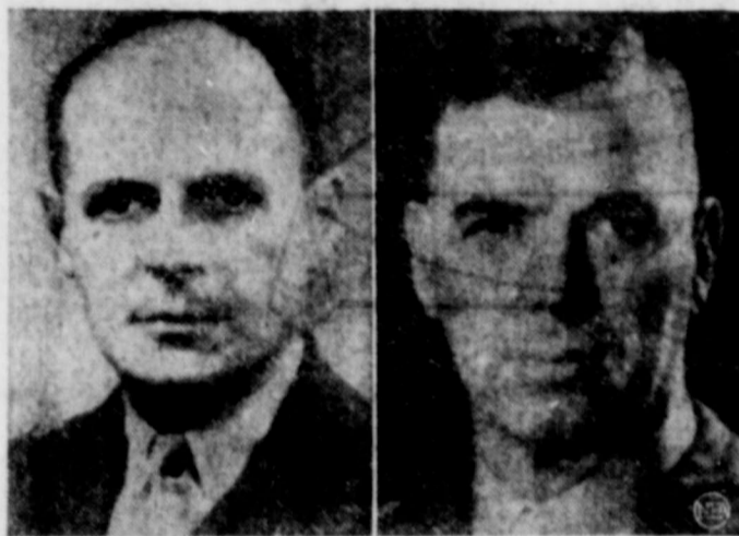
RIDGWAY NAMED TO SUCCEED MacARTHUR—Lt. General Matthew B. Ridgway, left, has been named by President Truman to succeed General Douglas MacArthur, who was relieved of all his commands. At right, Lt. General James A. Van Fleet, who has been named to succeed Ridgway as commander of the 8th Army in Korea.