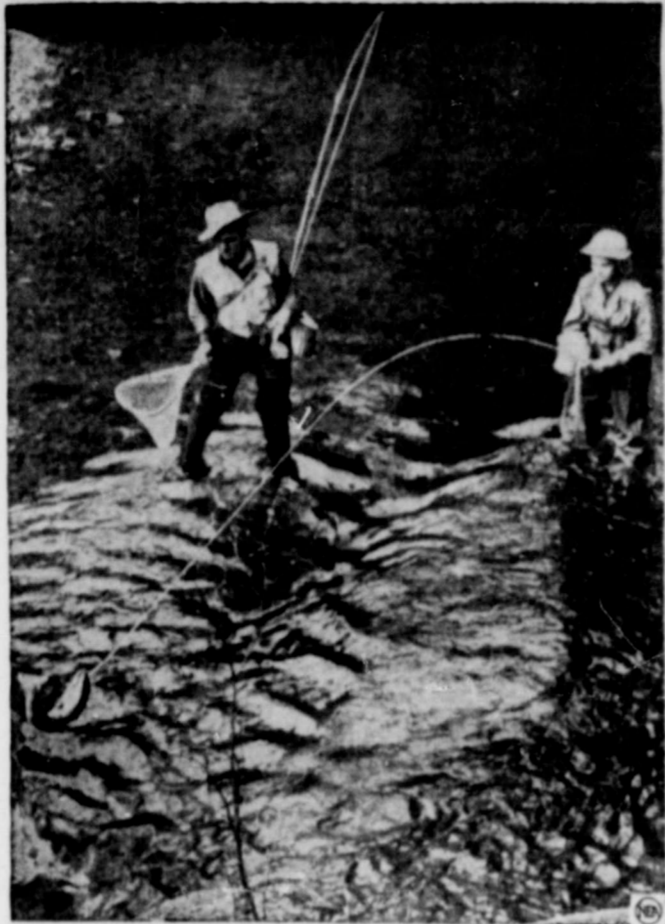
BEAUTY —With opening day of the Pennsylvania season approaching, anglers anxiously waited to sink hooks into brown brook and rainbow trout. They were poured into rapid mountain streams that have made the Pocono Mountains a paradise for Waltonians. This scene, taken at Pleasant Mount, will be duplicated many times.

United Press Association, NEA Newspaper Feature Association, Texas Daily Press League, Southern Newspaper Publishers Association.