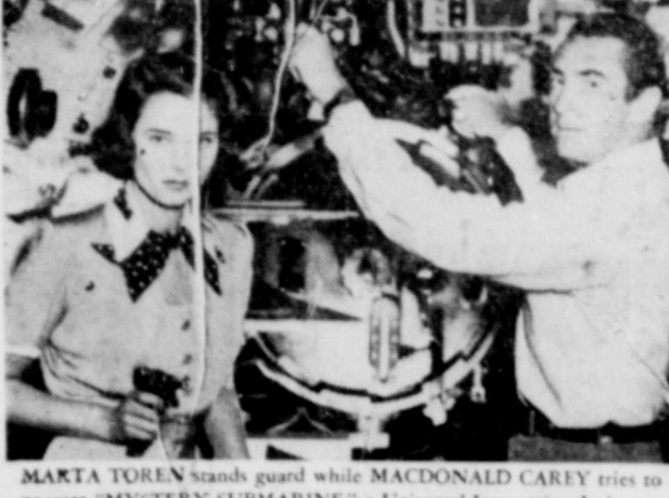
MARKA TOREN stands guard while MACDONALD CAREY tries to operate "MYSTERY SUBMARINE," a Universal-International picture.