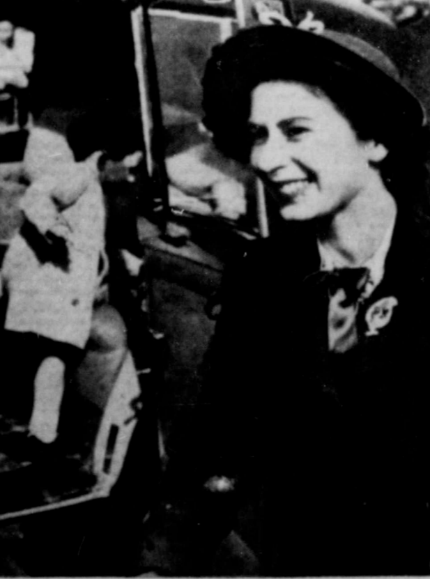
"LET'S GO NOW, MOM"—Young Prince Charles, age 2 1/2, wants his mother—Princess Elizabeth of Great Britain—to dispense with the formalities and get on her way at London Airport. The Princess was busy greeting the officials who met her on her return from Italy, but young Charles clambered into the waiting auto and was ready to ride.