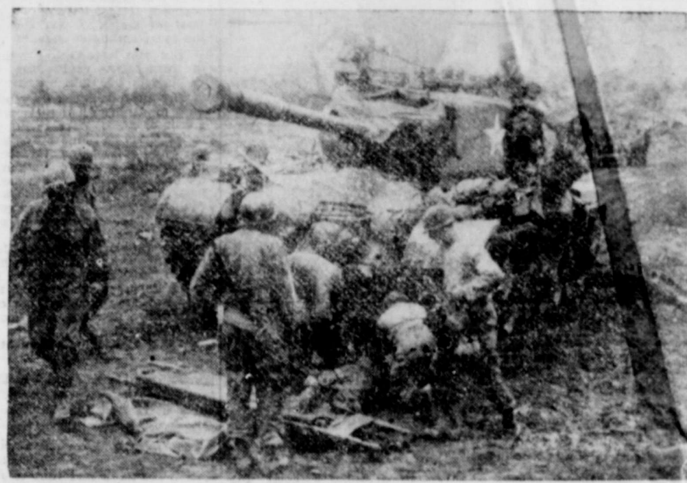
WOUNDED TANK CREWMAN RECEIVES AID—A medical corpsman moves in to administer first aid to a wounded tank crewman being extricated from the disabled vehicle. The tank was crippled, its treads blown off, when it hit a mine while passing along the road. UN forces are continuing their advance despite stiff resistance.

Miss Kutz' parents said they had started action to have the marriage annulled.