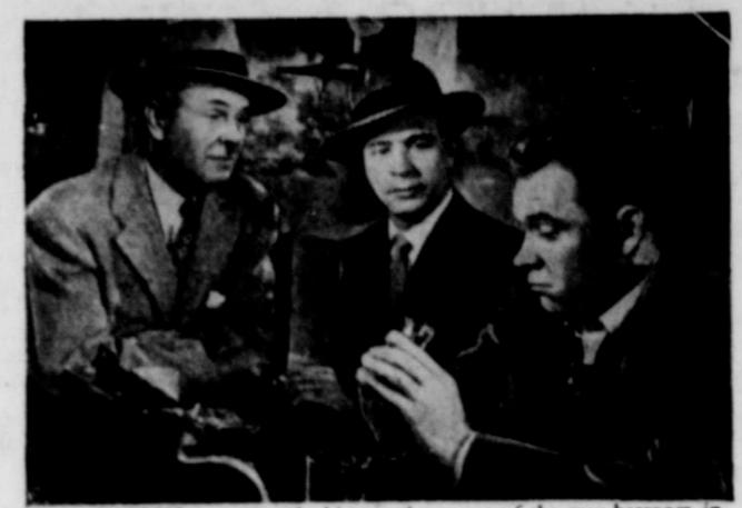
DICK POWELL (center) seeks his man in an out-of-the-way barroom, in this scene from RKO's exciting picture, "CRY DANGER."

I ain't done nothing." "Shut up." Suddenly the hood made a grab for the gun. Day clipped him on the chin with his fist but lost control of the car and they crashed into a streetcar. (Continued)