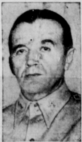
MAC'S AIDE QUILTS — Maj. Gen. Charles A. Willoughby, above, Gen. Douglas MacArthur's intelligence chief, will leave Tokyo soon to return to the U. S. for retirement. Willoughby is expected to testify before at least two congressional committees to defend his intelligence work in the Far East.