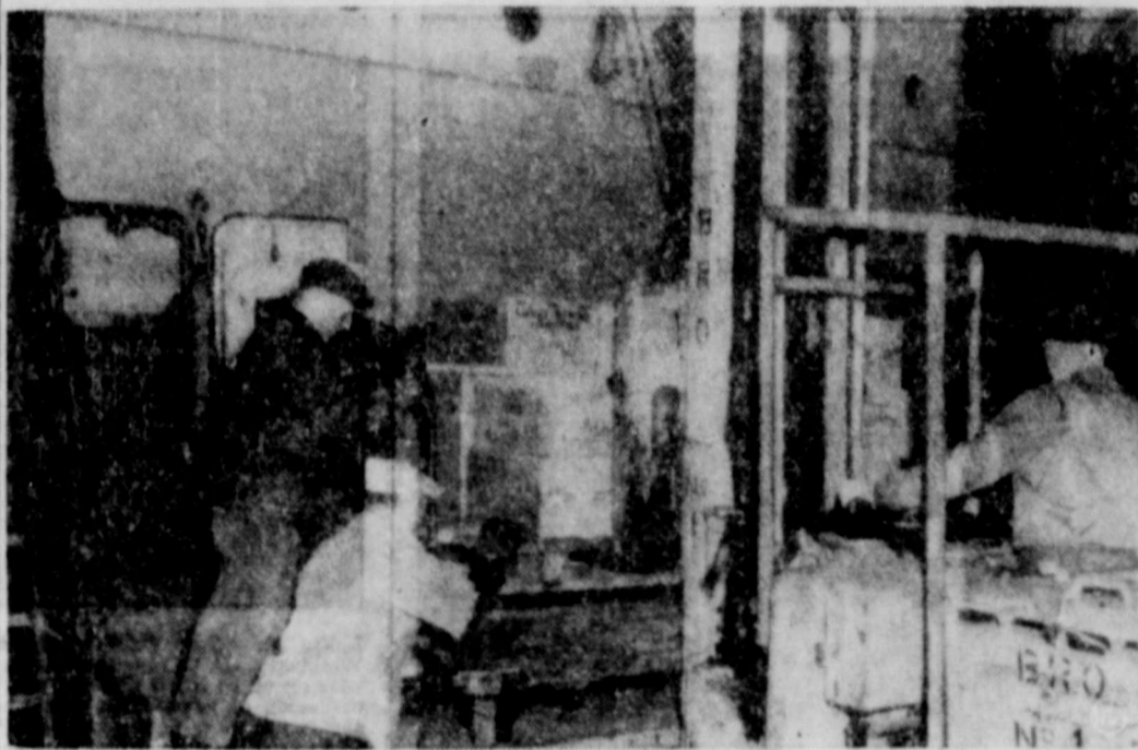
LONGSHOREMEN CALL OFF STRIKE—Longshoremen load the Queen of Bermuda with supplies in New York after the dockworkers unanimously decided to end the dockstrike.