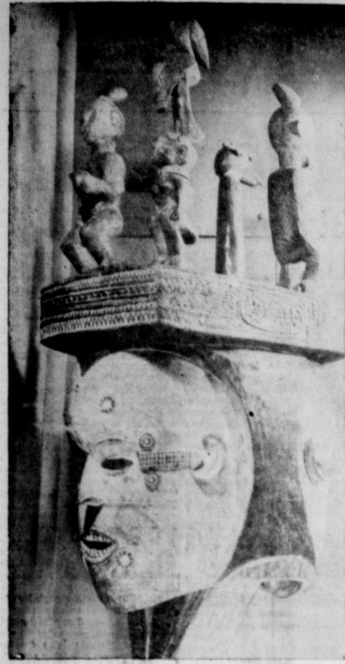
SOUTH PACIFIC TOTEM POLE—One of the many interesting exhibits that can be seen in the Ripley mobile unit here Wednesday, December 12, from 9 a.m. to 9 p.m.