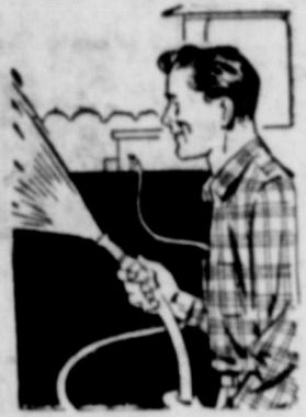
Adequate Water Supply

Approval Of The $1,500,000 Bond Issue Proposed By The Eastland County Water Supply District Means The Citizens Of That District Wish To Join Other Areas In Growth And Progress.