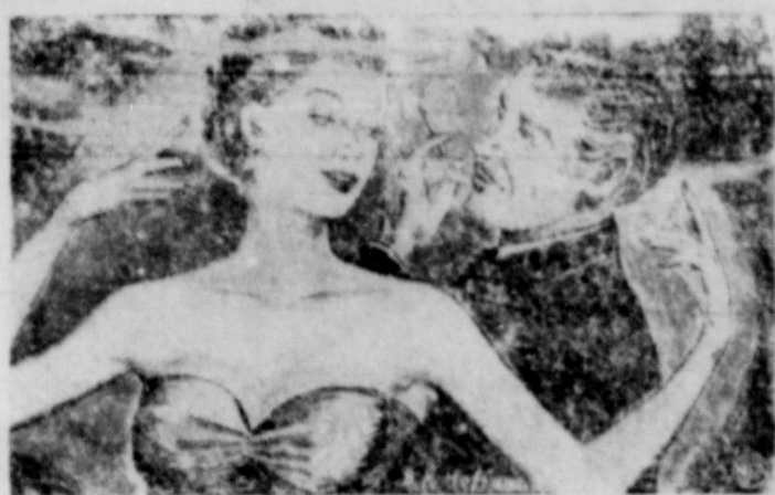
"You don't remember me? No matter!" Basil Willing underlined her words. "We are all supposed to know each other."