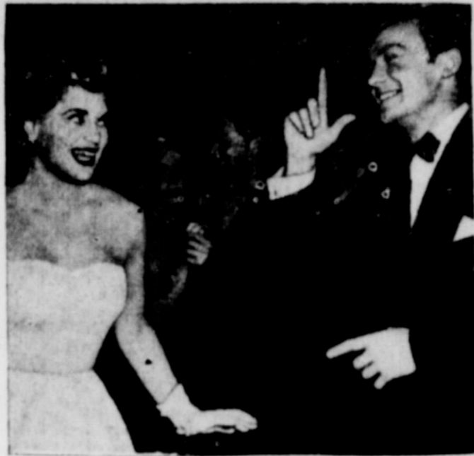
"The Marrying Kind" new Columbia Pictures' comedy at the Tower Theatre, stars Judy Holliday, Academy Award winner of "Born Yesterday", and introduces new comedy find Aldo Ray.