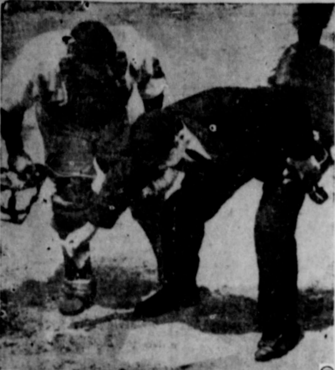
RAZZBERRA —Yogi Berra, a man of a few million well-chosen words, obviously didn't like the way Art Passarella was calling balls and strikes—and told him so. The umpire didn't appear to hear a word the Yankees' catcher said.