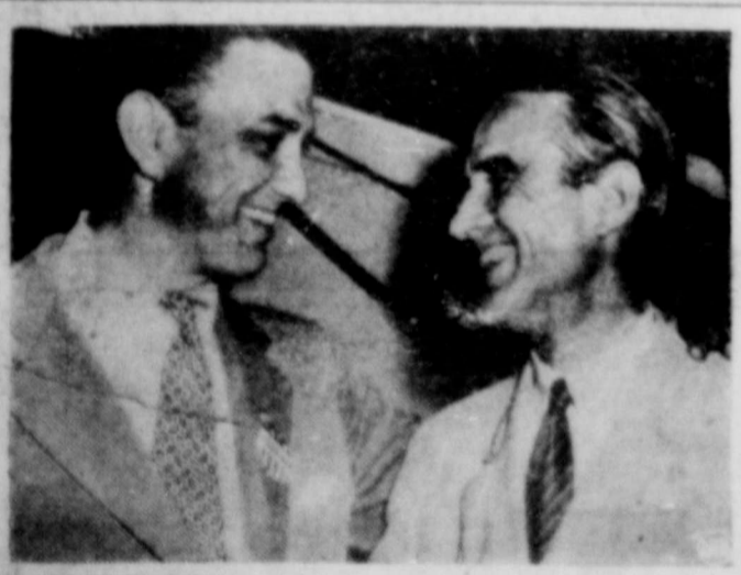
PLAN STRATEGY —Averill Harriman, right, and his campaign manager Franklin D. Roosevelt, Jr., display wide grins as they get together in Chicago to plan strategy in the forth-coming Democratic National Convention where Harriman is seeking the nomination as the Democratic candidate for the presidency.