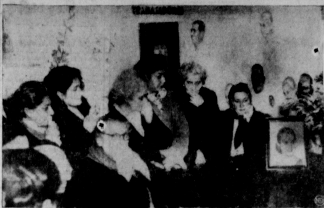
WEEP FOR EVITA—In one of Eva Peron's political committee meetings, the women weep and pray for their Evita upon learning of her death. Mrs. Peron, wife of the Argentine President, Juan Peron, died in Buenos Aires July 26 from cancer.