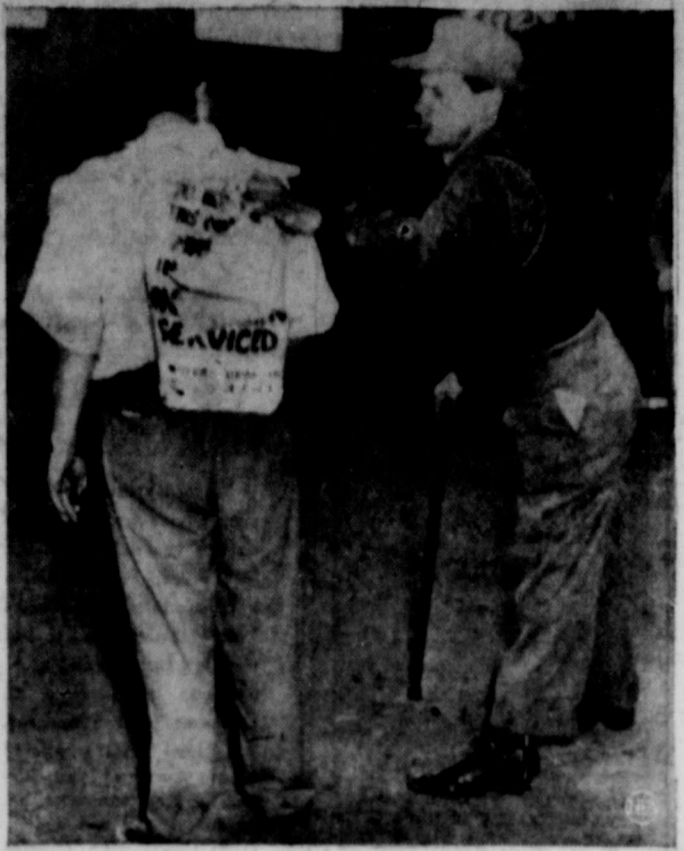
FOR A FREE AMERICA —Unidentified passerby, right, who said he believes in a free America, rips a sign from the back of a picket in Akron, Ohio. The picket, member of a juke box union, was picketing a local bar in an attempt to force the operator of the bar into joining the union.