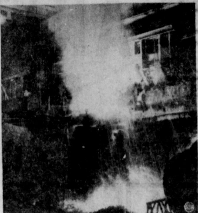
FIRST IN 55 DAYS—Sparks fly for the first time in 55 days as an open hearth is tapped at the South Chicago plant of the US Steel Corporation July 28. Despite the fact mills are once again in operation, it will take the nation's economy eight months to fully recover.

Instead of always late with your keys, Eastland County car owners will be singing "for inspection" on September 7 if something drastic isn't done.