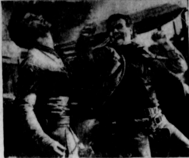
One of the most shattering fist battles ever shown on the screen takes place between Montgomery Clift and John Wayne in this tremendous scene from Howard Hawk's western saga, "Red River," at Tower Theatre now. On the same bill can be seen another spectacular western, "Tulsa," starring Susan Hayward.