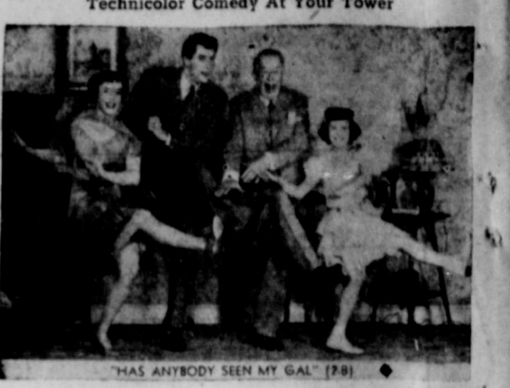
"Has Anybody Seen My Gal." Universal-International's new Technicolor comedy hit, captures the nostalgic spirit of the Turbulent Twenties and features five popular song hits of that colorful era. Stars of the new laugh film, Piper Laurie, Rock Hudson, Charles Coburn and Gigi Perreau, are shown above cutting a mean rug—1928 style. "Has Anybody Seen My Gal" is showing Sun. - Mon. at your Tower Theatre.