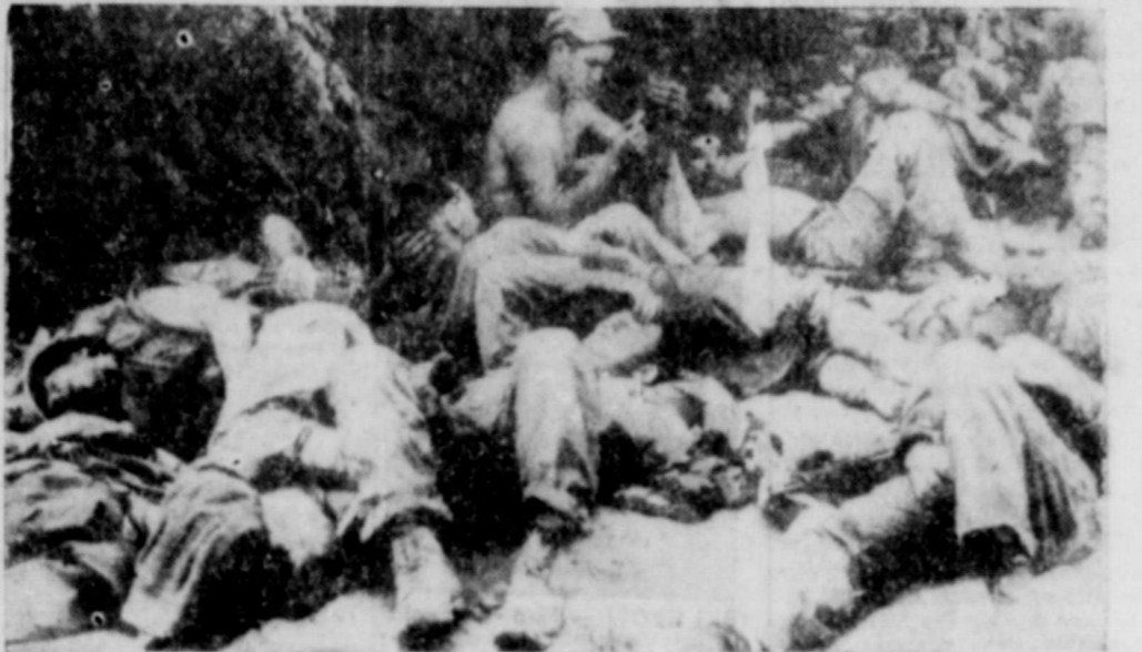
BACK FROM NIGHTMARE —Troops from "Item" Company who fought and won the strategic height of Bunker Hill, are back from the nightmare. The dirty, exhausted and bearded fighters, their clothes torn and dark with sweat, sprawled everywhere there was available space as they try to catch up on much needed sleep and rest.

Drive An Oldsmobile Before You Buy! Eastland, Texas OSBORNE MOTOR CO.