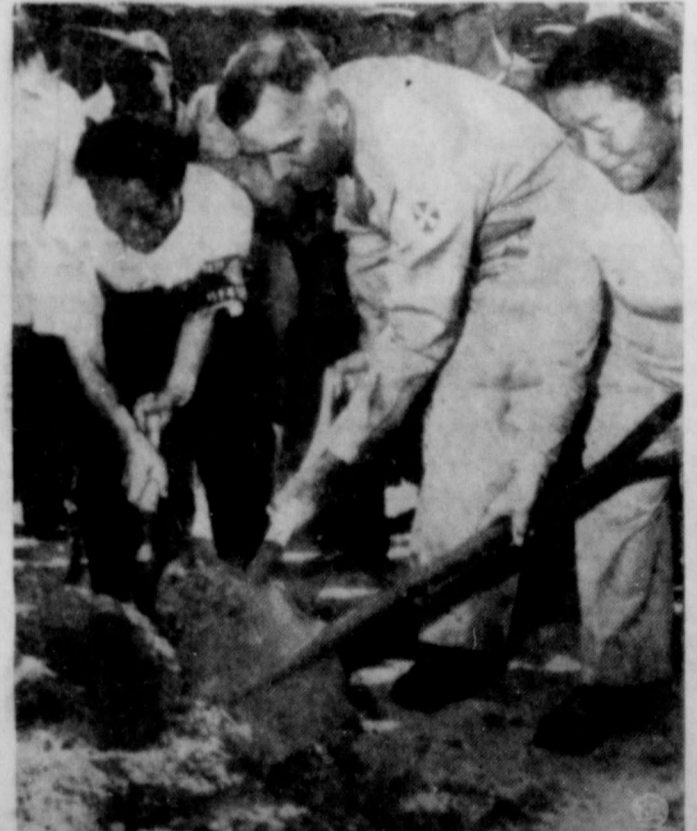
REHABILITATION PROGRAM—Eighth Army Commander Lt. Gen. James A. Van Fleet takes his turn with a shovel as the rehabilitation program of war devastated Seoul, launched by South Korean President Syngman Rhee August 21, gets under way. Gen. Van Fleet promised the Korean people the United Nations would stay in Seoul and that the old capital "will never again" be taken by the communists.

Drive An Oldsmobile Before You Buy! Eastland, Texas OSBORNE MOTOR CO.