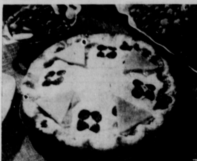
Cool weather calls for hearty desserts—such as this tender, juicy Apple Pie—served warm.