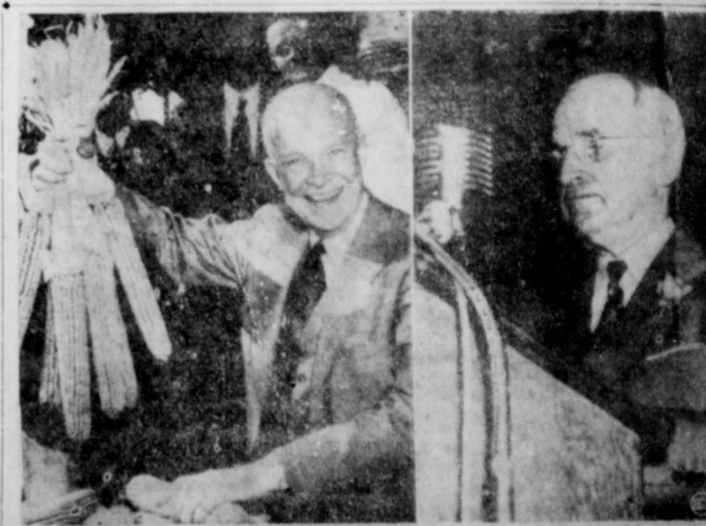
GETTING HOTTER —Gen. Dwight Eisenhower, left, GOP presidential candidate beams as he displays some of the choice ears of corn presented him by admirers when he made a platform appearance at Bloomington, Illinois. Invading the home territory of his Democratic opponent, the General told a cheering crowd at Peoria that the economy of the United States has been propped up by "war and the threat of war." In Tacoma, Wash., President Truman, right, told an audience of 5,600 persons that Gen. Eisenhower has led too sheltered a life in the Army to know anything about the "bread-and-butter problems of the average American."

All members and friends are invited and urged to attend this important session. A basket lunch will be served at noon.