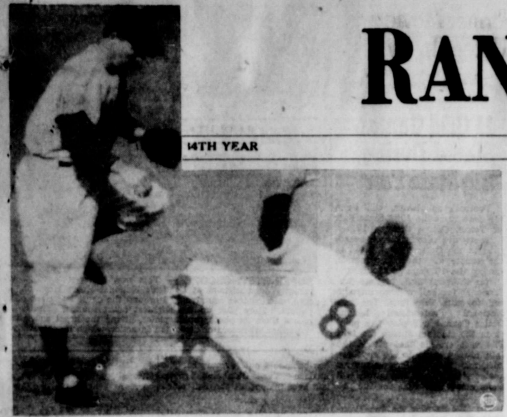
YOGI SAFE —His injured fingers high in the air, Yankee catcher Yogi Berra slides in to second base in the fourth inning of the sixth game of the World Series played at Ebbets Field. Yogi was safe but Pee Wee Reese's throw to first on an attempted double play went into the dirt for an error.