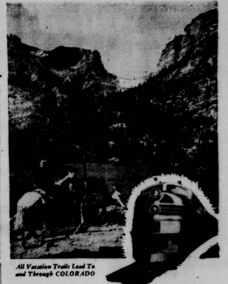
All Vacation Trails Lead To and Through COLORADO

A new home freezer described as a "complete kitchen unit" has been announced by The Maytag Company of Newton, Iowa. With six net cubic feet of locker storage space and a capacity of 300 lbs. of meat or 240 lbs. of mixed packages, it maintains an operating temperature of zero Fahrenheit in all climates. When closed it provides a porcelain enamel utility table top with slanted drop leaf for dinnets, purposes, large enough for two people. Inset shows counter-balanced lid opened and defrosting tray in use.