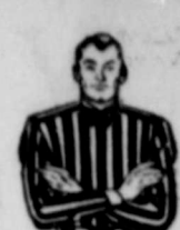
DELAY OF GAME