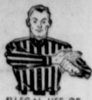
ILLEGAL USE OF HANDS AND ARMS