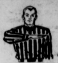
ILLEGAL MOTION OR SHIFT