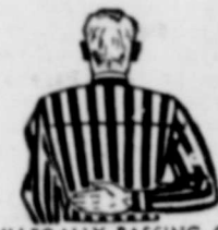
ILLEGALLY PASSING OR HANDING BALL FORWARD