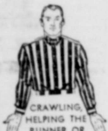
CRAWLING, HELPING THE RUNNER OR INTERLOCKED INTERFERENCE