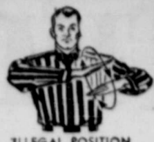
ILLEGAL POSITION OR PROCEDURE