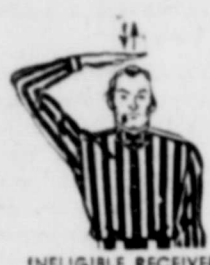
INELIGIBLE RECEIVER, DOWN FIELD ON PASS