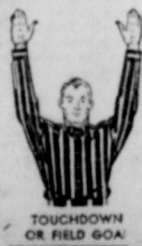
TOUCHDOWN OR FIELD GOAL