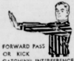
FORWARD PASS OR KICK CATCHING INTERFERENCE