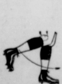
ROUGHING THE KICKER