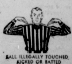
BALL ILLEGALLY TOUCHED, KICKED OR BATTED