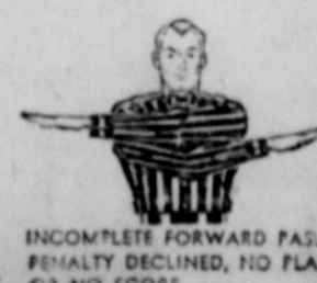
INCOMPLETE FORWARD PASS, PENALTY DECLINED, NO PLAY OR NO SCORE