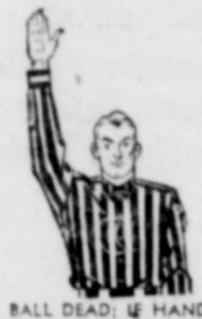
BALL DEAD, IF HAND IS MOVED FROM SIDE TO SIDE; TOUCHBACK