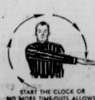
START THE CLOCK OR NO MORE TIME-OUTS ALLOWED