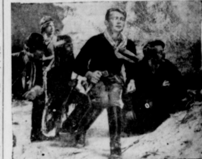
Robert Mitchum (right), Charles McGraw and Richard Egan (left), suspect enemy soldiers of infiltrating their front lines disguised as refugees, forcing innocent natives to conceal their identity, a spine-tling scene from Howard Hughes' presentation, "One Minute to Zero." Showing Sun. - Mon. at your Ranger Drive-In Theatre. (Bottom) Alan Ladd (center) and John Ireland (right), with an assist from some ruthless redskins, are about to launch an ambush in this scene from Hal Wallis' "Red Mountain." Showing at the Tower Theatre.