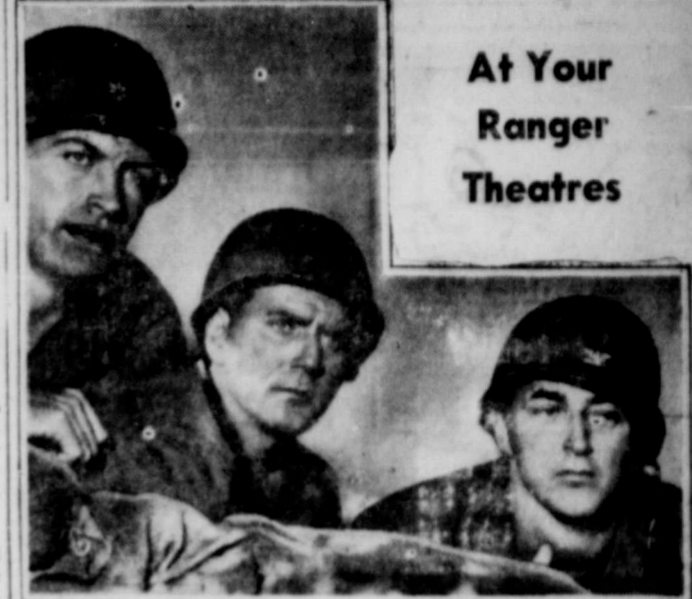
At Your Ranger Theatres

FOR SALE 105 acres, 5 room house, good barn, plenty water, some minerals, 5 miles out. 126 acres—4 room modern house, well water, gas, close in, minerals. 7 room house, 12 lots, A-1 condition. Bargain for quick sale. C. E. MADDOCKS & CO. Mrs. James Higdon Mgr. Real Estate Department After 5:30, Phone 59