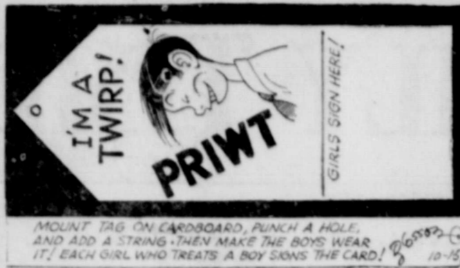
MOUNT TAG ON CARDBOARD, PUNCH A HOLE, AND ADD A STRING—THEN MAKE THE BOYS WEAR IT! EACH GIRL WHO TREATS A BOY SIGNS THE CARD!