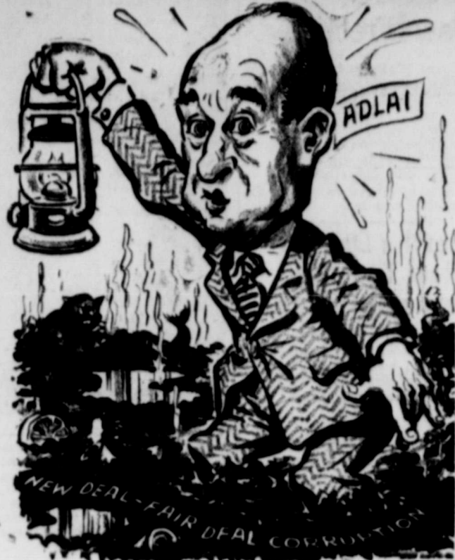
(Pd. Pol. Adv.)