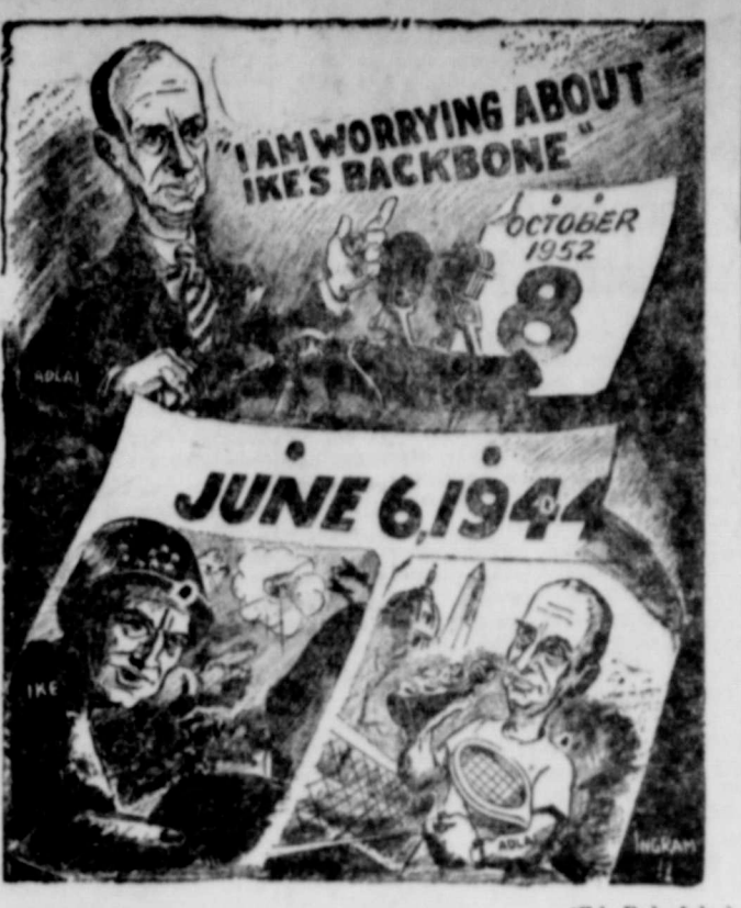
(Pd. Pol. Adv.)