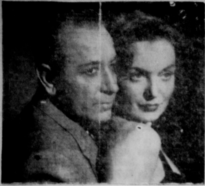
George Raft and Dorothy Hart co-star in the dramatic expose "Loaf Shark" now showing at the Ranger Drive-In Theatre.