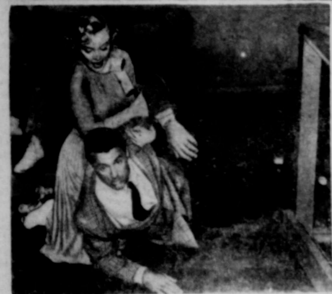
Top Picture: Escape seems to be the main thing on Gary Cooper's mind in this scene from "Springfield Rifle," Warner Bros. outdoor film in WarnerColor, which opens Sunday at the Tower Theatre. Bottom Picture: The frisk is on the froth in the new movie frolic, "Monkey Business," now at the Ranger Drive-In Theatre. In the example shown here, Cary Grant is down for the count, but who wouldn't tumble for Marilyn Monroe?