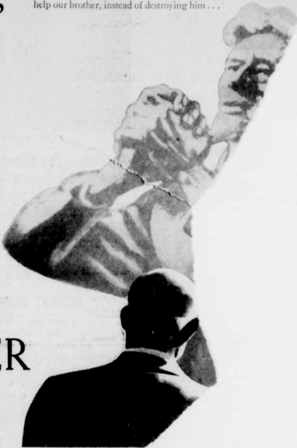
GENERAL EISENHOWER BOWING HIS HEAD IN RECENT MEETING IN

...humble enough to depend ...tough enough to fight the enemies that challenge our democracy ...competent enough to lead without war.