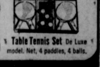
Table Tennis Set De Luxe