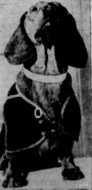
VERY "DOGGY" —"Nickie," pedigreed dachshound, models the very latest thing in canine adornment for dogs with wealthy owners. A rhinestone-studded collar and a black satin dog coat are just the thing for the "dog-about-town." Nickie was one of several doggy models who recently waggled their way through a fashion show held in a New York restaurant.