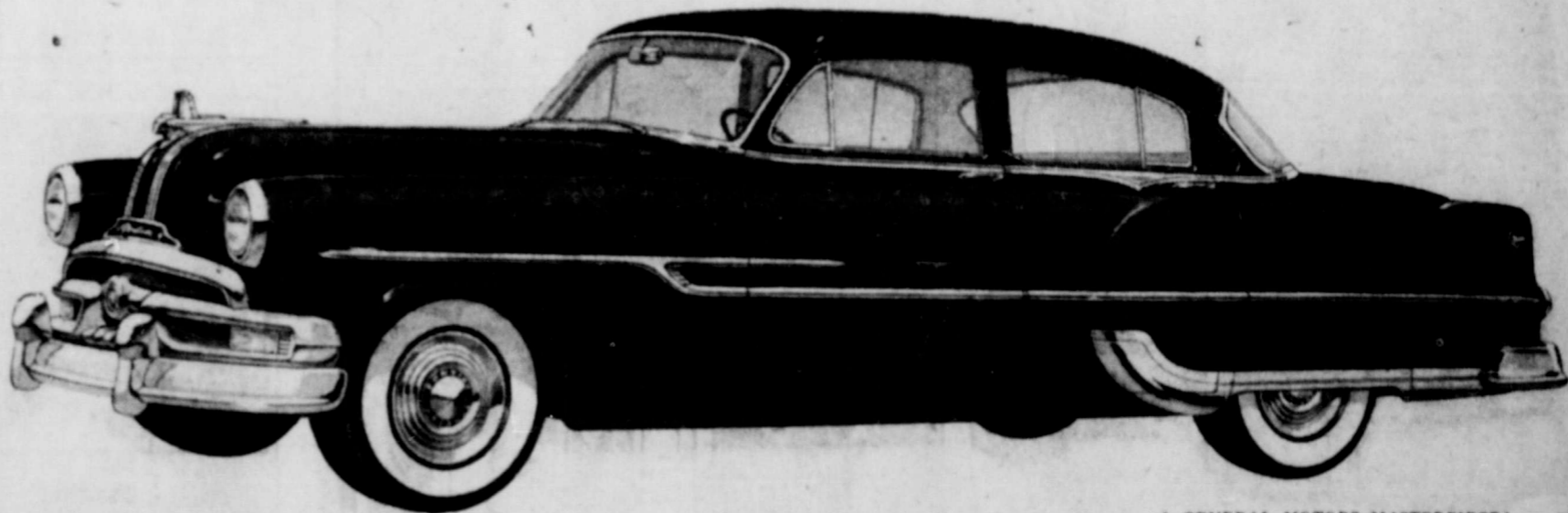
A GENERAL MOTORS MASTERPIECE!

SEE THIS NEW DUAL-STREAK BEAUTY IN OUR SHOWROOMS TOMORROW!