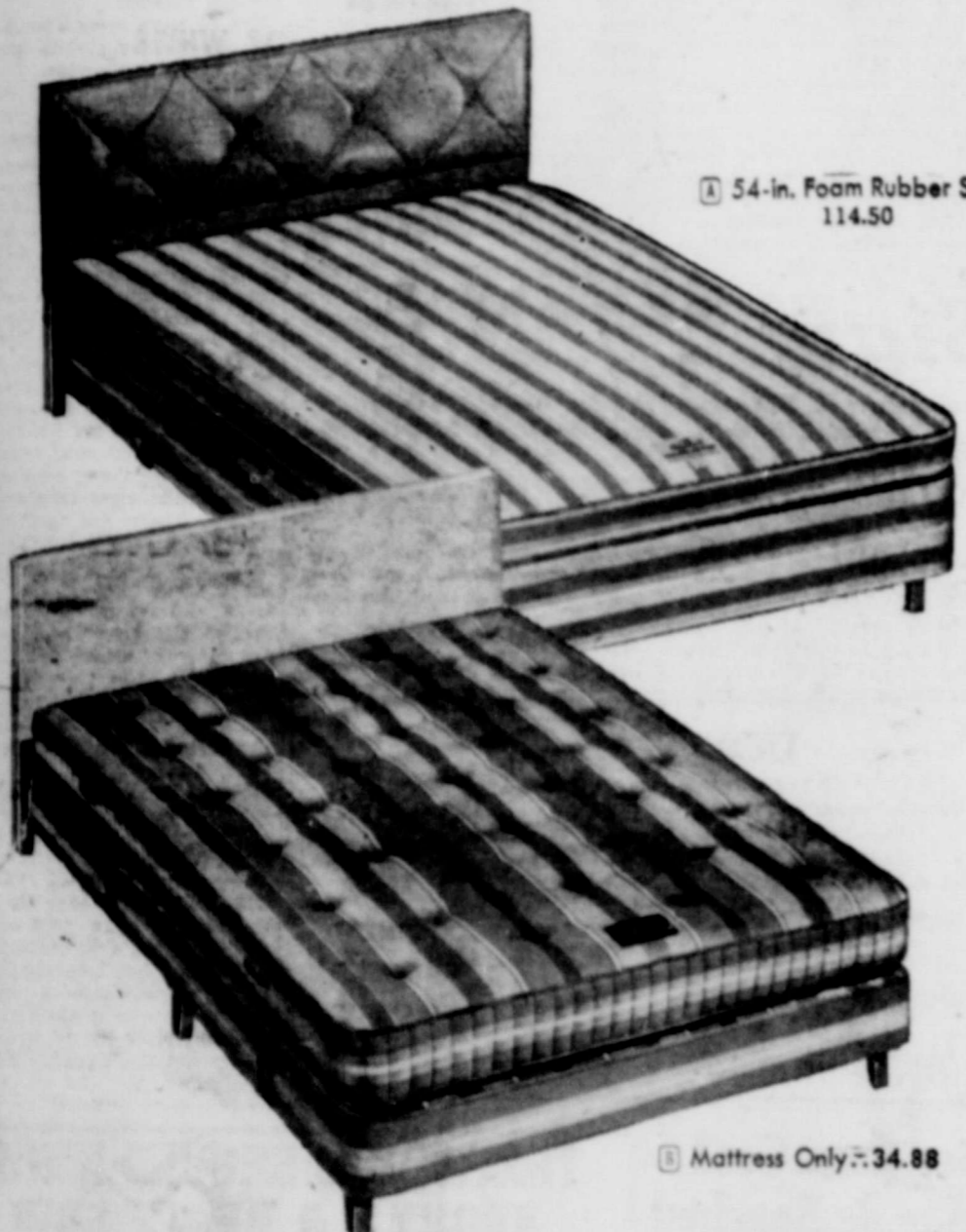
54-in. Foam Rubber Set 114.50