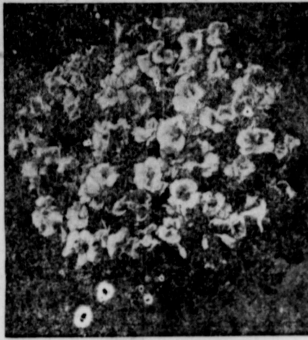
Fragrant Double Dwarf Nasturtiums.

In selecting flowers to grow for cutting, be sure to have some blue flowers, as well as yellow, orange, pink and red. Blue is always needed to balance the color scheme in flower arrangements to be used indoors, and it is also needed if the garden where there is usually an over-abundance of red and yellow flowers, for the best effect. Ageratum, centaurea cyanus, heavenly blue morning glory, scabiosa, and asters give excellent blue flowers. All these can be grown from seed sown now.