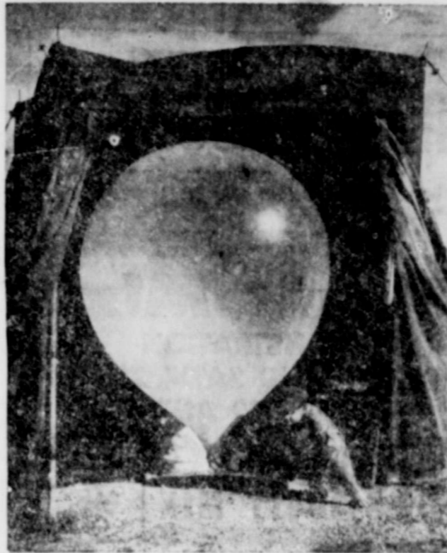
HOLDING THE BAG!—This helium-filled balloon soon will be on its way up into the stratosphere to gather valuable weather data for Army anti-aircraft sharpshooters at Camp Nupuna, Okla. Balloons like this haul aloft radiosonde—electronic weathermen—which relay back to earth weather data vital to pin-point accuracy.

In a game to follow the Olden-Scranton tilt, Cisco Junior College tackles Decatur J.C. A separate admission price will be charged for each game.