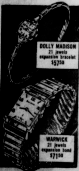
DOLLY MADISON 21 jewels expansion bracelet $57.50