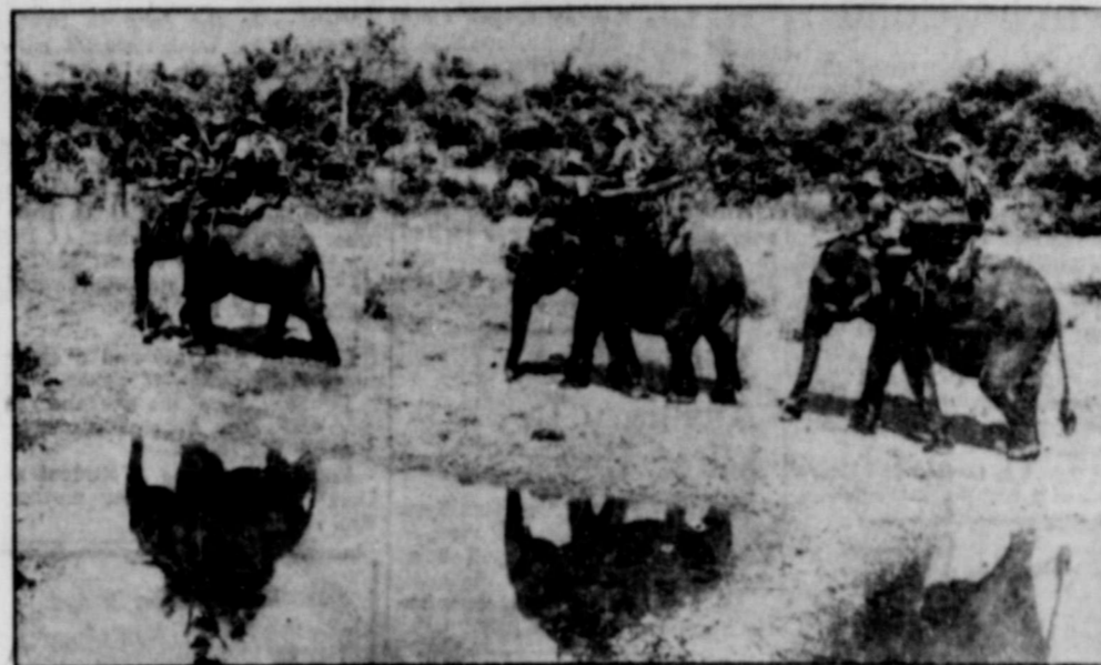
MODERN WARFARE?—An elephant patrol moves through the brush country of Cambodia, French Indo-China. The giant animals are used to transport food, supplies and munitions to troops on patrol in the country, now in its seventh year of war. Due to their size, elephants are well suited for travel through the thick and bushy Cambodian vegetation and across the half-flooded regions.

SEE DON PIERSON— Olds - Cadillac Before You Trade Eastland