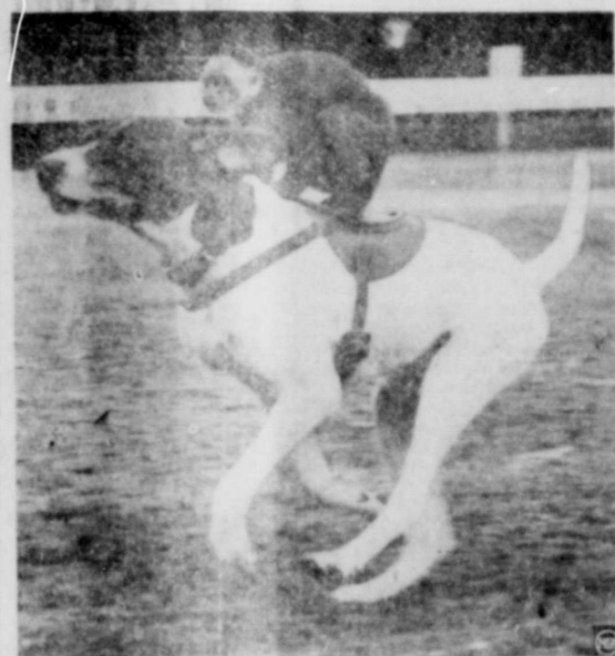
MONKEY BUSINESS—Mickey seems right at home in the saddle guiding his mount, Rex, around the turf at Pinehurst. N. C. Pets of trainers at Newport Stock Farm Stables, a special saddle was built for the monkey.

Orders will be taken in Breckenridge Monday morning for emergency feed.