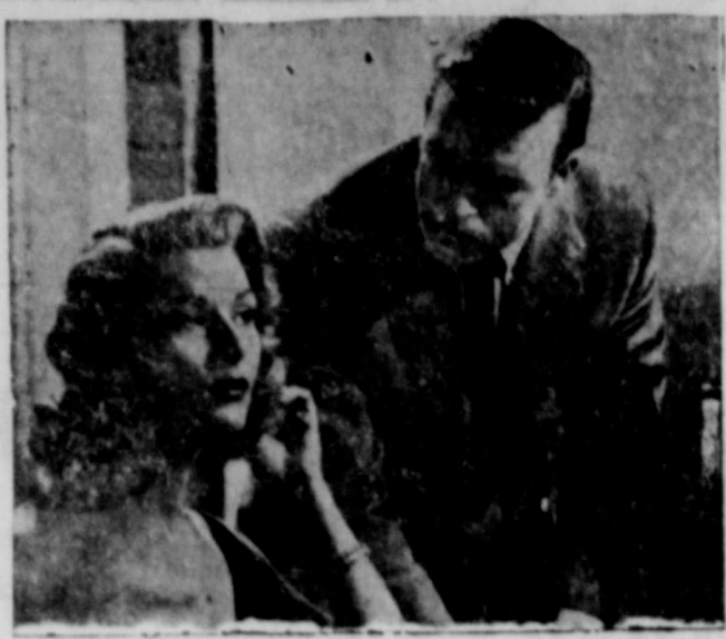
Intrigue — Scott Brady and Mary Castle are involved with diamond smugglers in "White Fire" thrill-packed picture at your Tower Theatre Tuesday and Wednesday.

NEW STAINLESS In 90% of cases of simple piles—tested by doctors—amazing Pazo Ointment stopped bleeding, reduced swelling, healed cracking, shrunk piles WITHOUT SURGERY! Pain was stopped or materially reduced. Pazo acts to soothe, relieve itching instantly. In tubes, also modern Suppositories at all drugists. Get Pazo today for wonderfully fast relief right away. Call 224 For Classified Ad Service