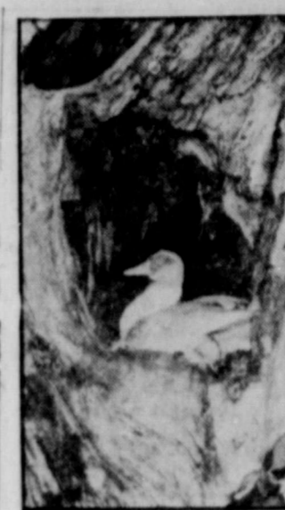
BIRDIE SHOT—The photographer got this "Birdie" at a country club golf course in Reading, Pa. Sitting four feet off the ground in a dead apple tree is a Muscovy duck which is expecting a flock of ducklings any day now.

In northwest Texas, however, stalks are left standing until after the first hard freeze. Low temperatures kill the bollworms in the exposed bolls on the plant.