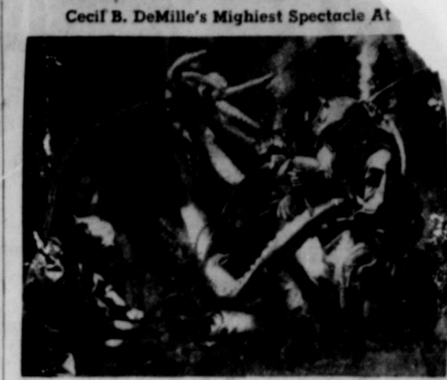
A scene of one of Cecil B. DeMille's greatest spectacles of the sea "Reap the Wild" filmed in Technicolor and starring John Wayne, Susan Hayward, Ray Milland and Paulette Goddard. Playing at your Tower Theatre Tuesday, Wednesday and Thursday.